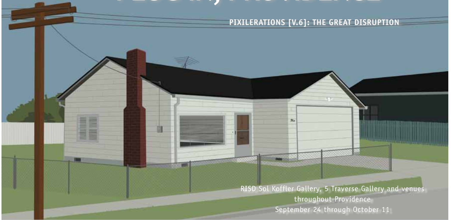
RISD Sol Koffler Gallery, 5 Traverse Gallery and venues throughout Providence September 24 through October 11

PIXILERATIONS [V.6]: THE GREAT DISRUPTION