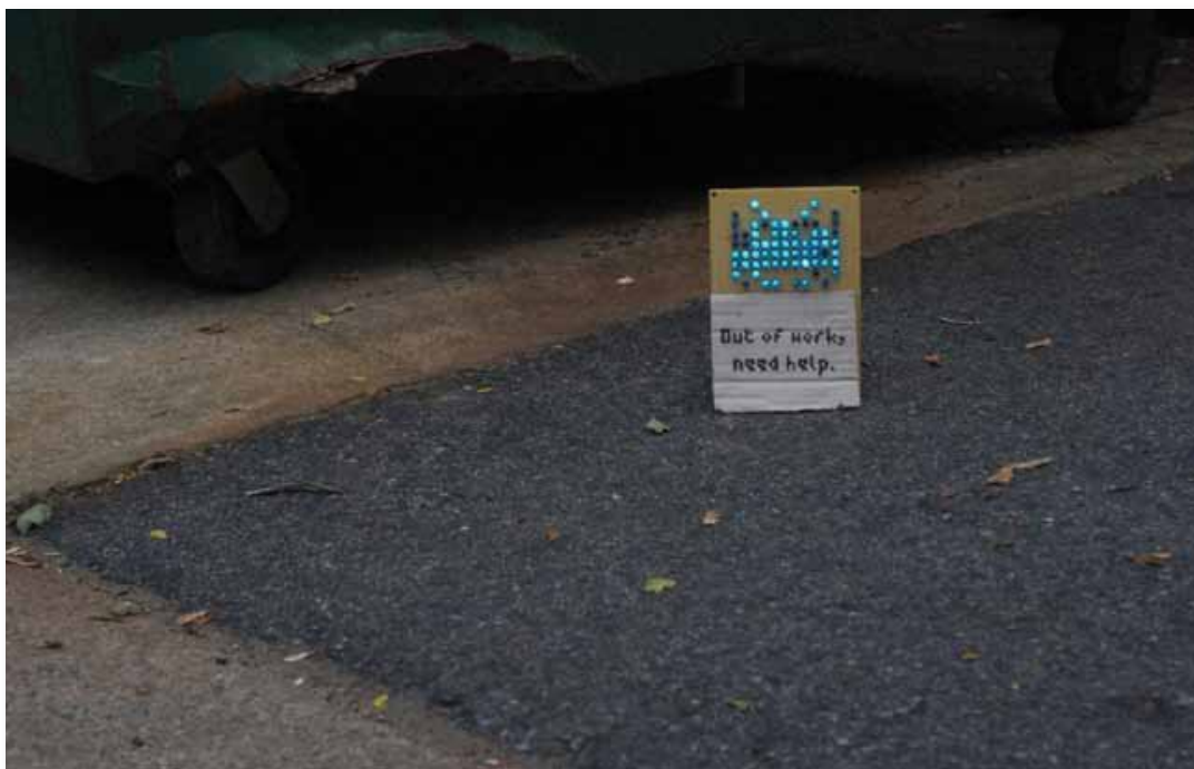
ABOVE TOP TO BOTTOM: Colin Williams, The Empire , 2009, HD animation, 4 minutes. Andrew Ames, Space Invader Returns Home , 2009, mixed media, custom electronics.