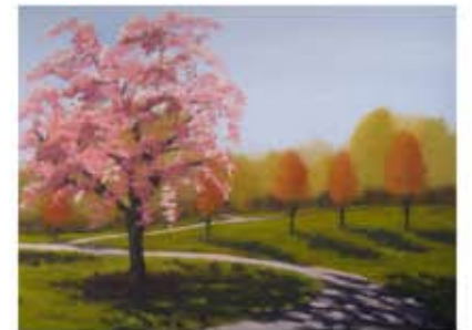
Spring Colors Three / Fort Hill Park by Pamela Warnala Pastel Pleasures at the WHMA